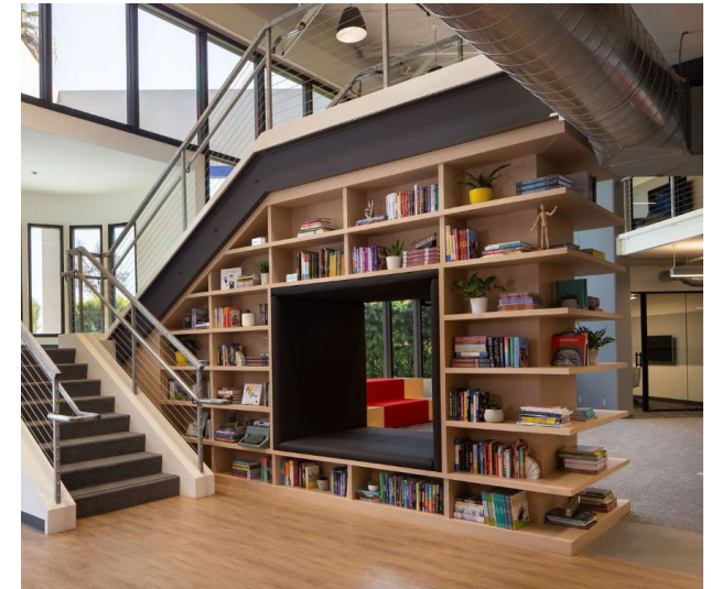
02 – 147 Castilian Drive, downstairs creative open space