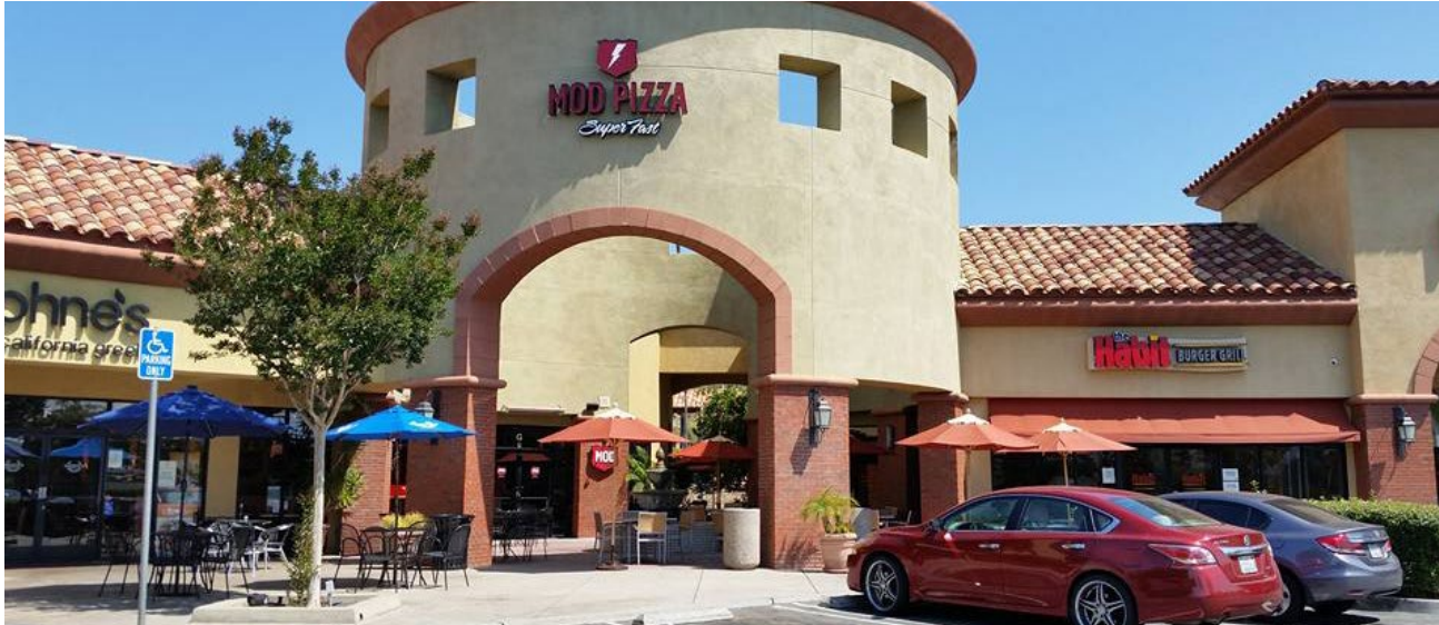
01 – MOD Pizza