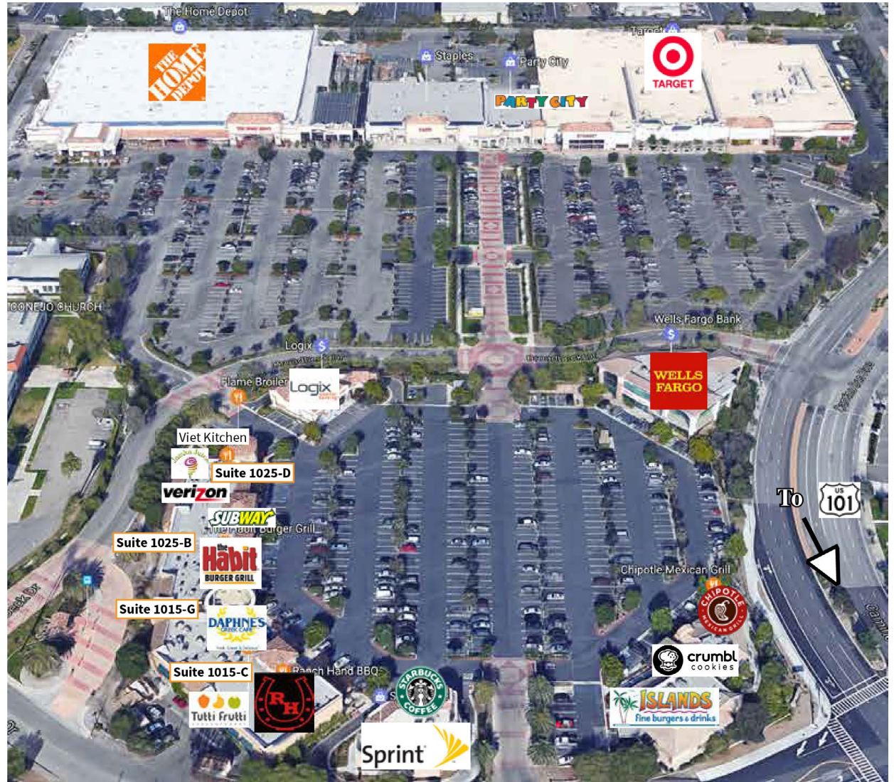
06 – Aerial view of Newbury Village.

Median Visitor Household Income $118,700