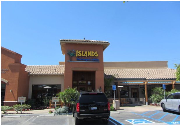
03 – 5,950 SF Islands Restaurant