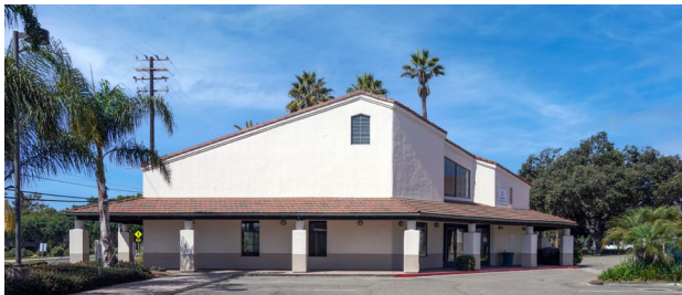
02 – 5340 Patterson.