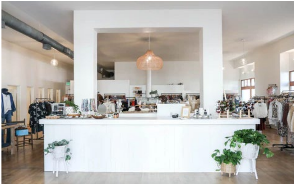
04 – Kariella interior at 833 State Street.