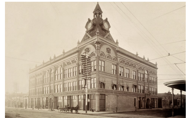
01 – Fithian Building historical photo.