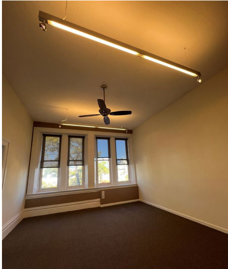
02 – Suite 203 facing State St.