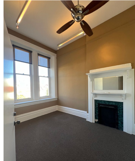
04 – Suite 203c facing State St.