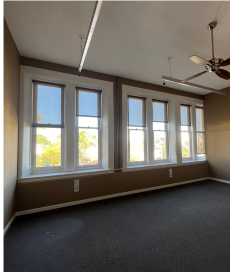
03 – Suite 203b facing State St.