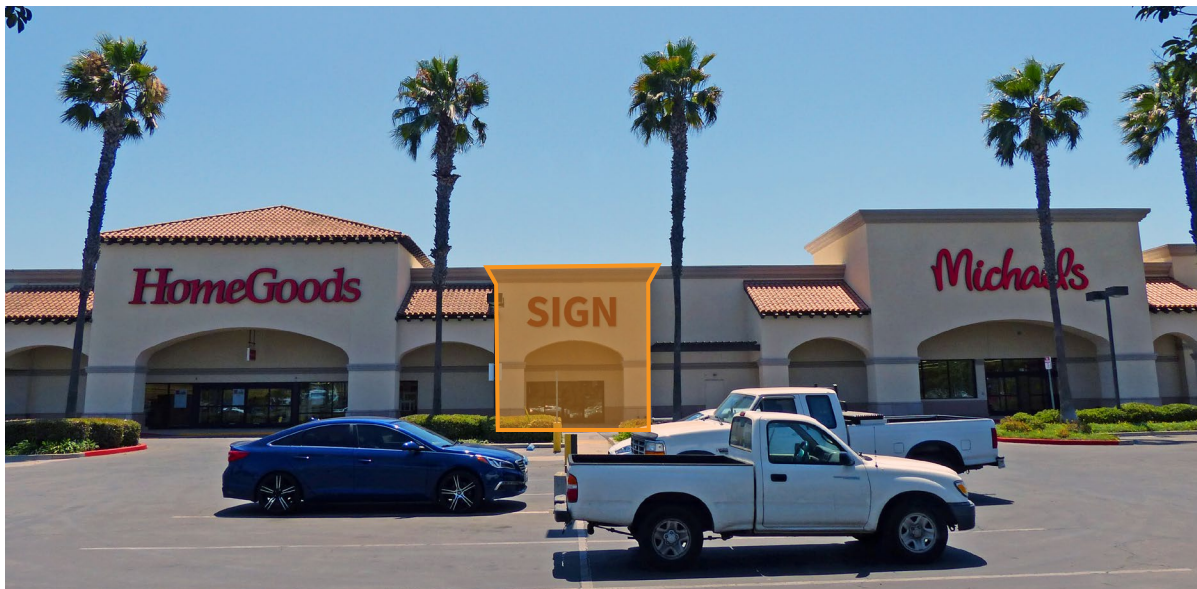
02 – North west view of Suite 347