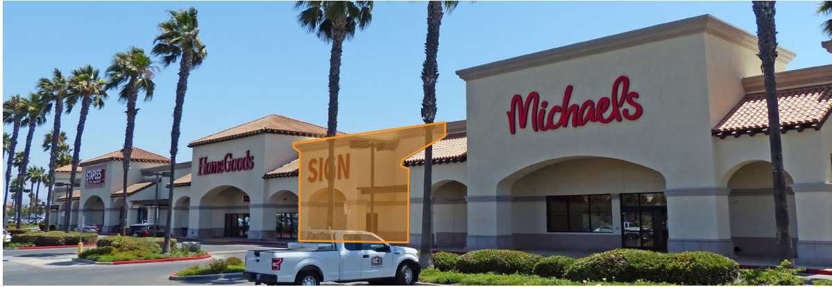
01 – Suite 347 Signage