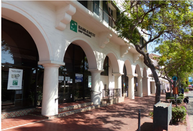
01 – State Street frontage.