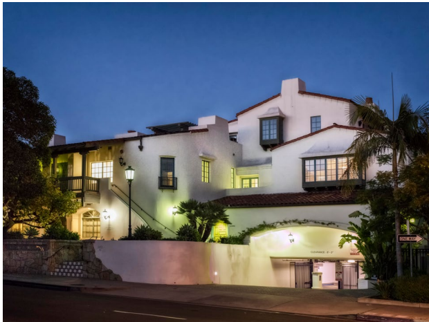
03 – Building frontage & underground parking entrance