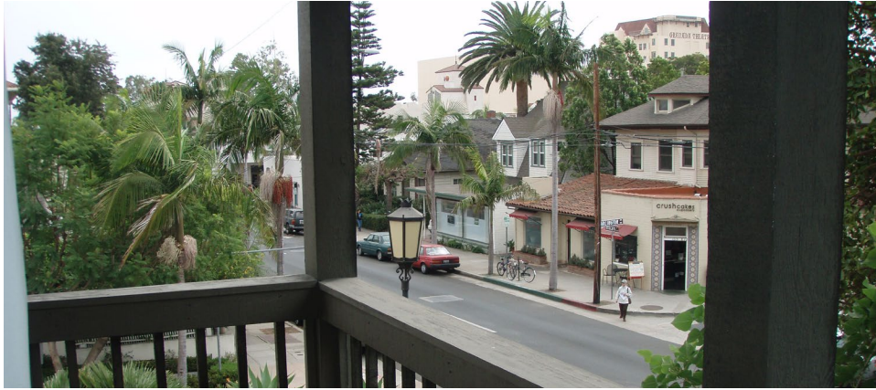
01 – 2 nd Floor Balcony overlooking Anacapa Street