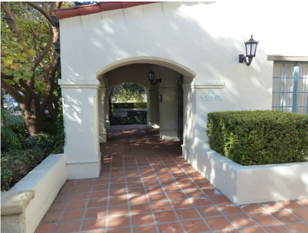
03 – Entrance from Anacapa Street