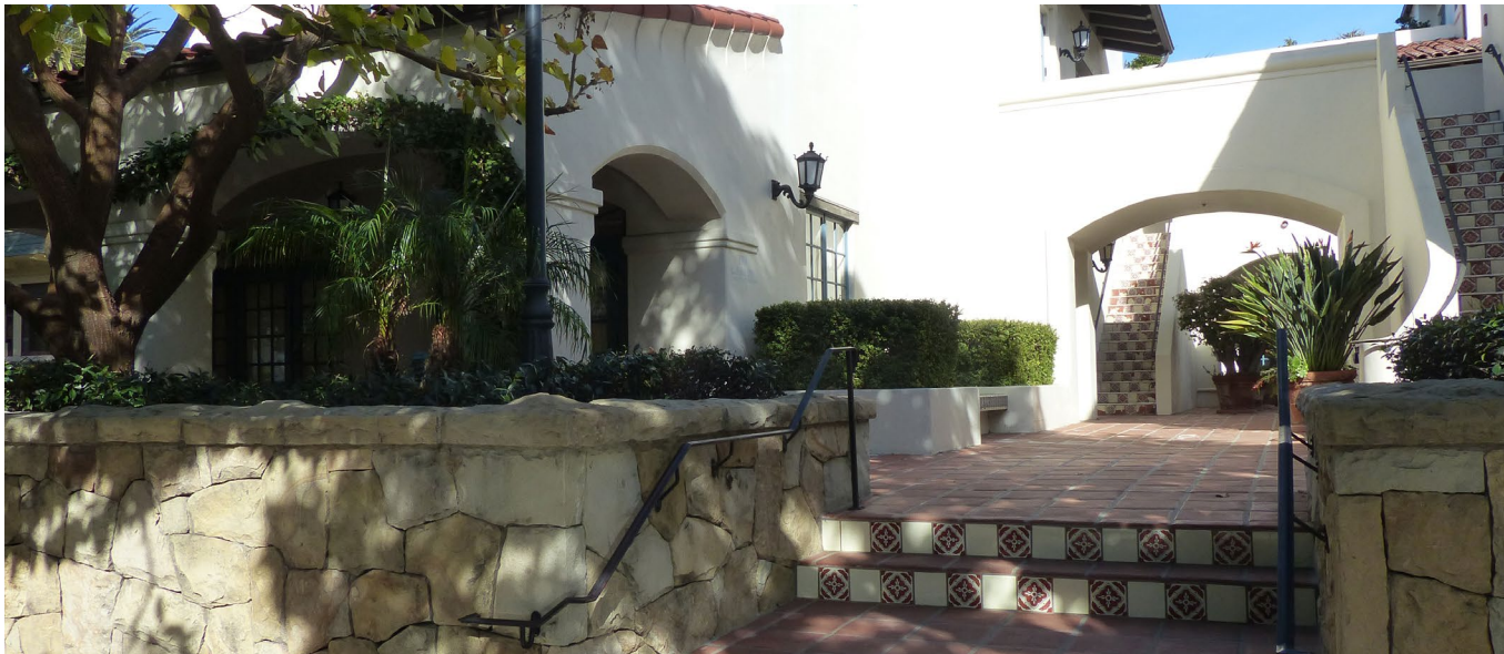
02 – Courtyard entrance from Anacapa Street

1332 Anacapa Street is a Mediterranean-style building with courtyard in a desirable mid-town location, adjacent to State Street and the Arlington Theatre. Walking distance to Santa Barbara Public Market and a host of other restaurants, cafes and amenities available in downtown Santa Barbara. Underground, gated and reserved parking included in leases. This 2-story building and underground parking lot are elevator served.