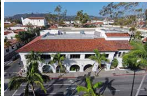
Corner of E. Figueroa Street and Anacapa Street